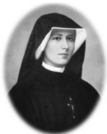
St. Faustina Kowalska

Divine Mercy for America responds to the “signs of the times” by tracing out a path for people of faith, particularly Catholic Christians, to follow in the footsteps of Saint Faustina by employing the same prayers, promises and sacrifices for America that she offered the Lord for Poland.