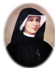
St. Faustina Kowalska

Divine Mercy for Canada responds to the ever growing need for hope, action and prayer to combat the evil threatening our families and world today. Following in the footsteps of Saint Faustina we find a path traced out for us employing the same prayers, promises and sacrifices for Canada that she was guided to offer for her motherland. In the manner of Saint Faustina, may we become ever better living vessels of Christ—truly pleasing to God in deed, word and prayer.