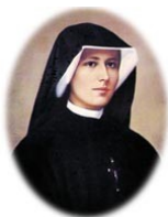
St. Faustina Kowalska

Divine Mercy for America responds to the “signs of the times” by tracing out a path for people of faith, particularly Catholic Christians, to follow in the footsteps of Saint Faustina by employing the same prayers, promises and sacrifices for America that she offered the Lord for Poland.