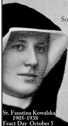
St. Faustina Kowalska 1905-1938 Feast Day October 5

Extraordinary Jubilee Year of Mercy Dec. 8 - Nov. 20 2016