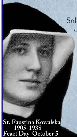
St. Faustina Kowalska 1905-1938 Feast Day October 5

Extraordinary Jubilee Year of Mercy Dec. 8 - Nov. 20 2016